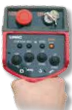
Radio remote control